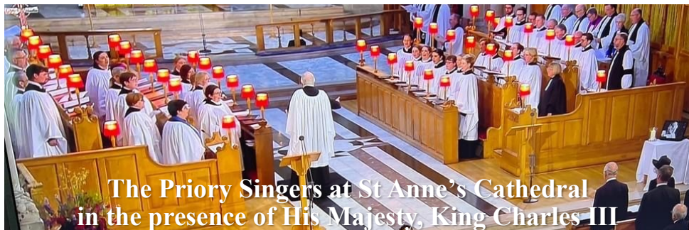
The Priory Singers at St Anne's Cathedral in the presence of His Majesty, King Charles III