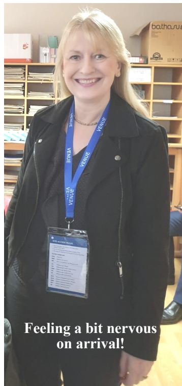
Feeling a bit nervous on arrival!