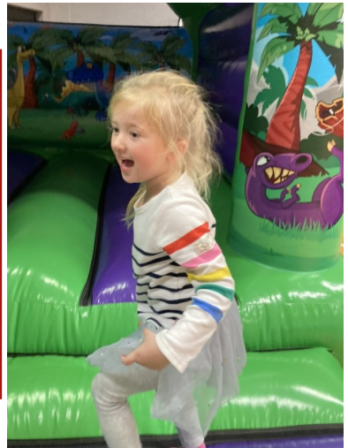
Lots of fun was had at our Hallowe'en Party!

Thank you to all our volunteer cleaners and gardeners—the church and grounds are looking splendid!